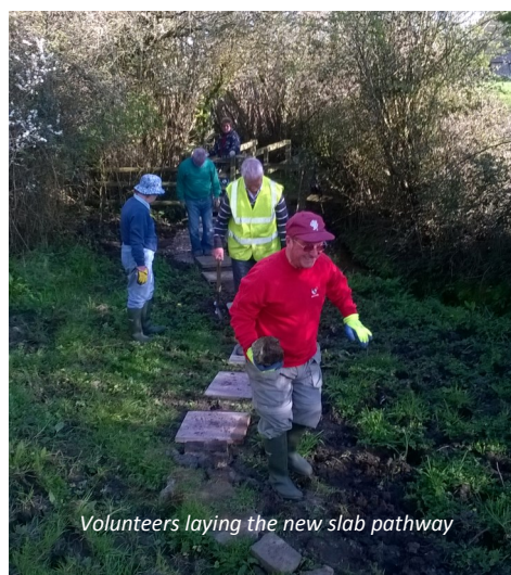
Volunteers laying the new slab pathway

lasted about 2 hours. We were pleased that 13 people took part and it was nice to welcome some new folks. We are planning more village walks from time to time, so look out for details in the Messenger.