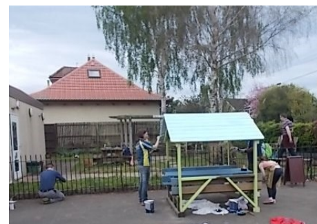
Working party transforming the playground

Council and I met and decided we needed to update some of the tired parts of our grounds. Those that volunteered on Saturday have given this a real kick start and we are currently having plans drawn up to improve the grounds further. With school budgets so tight, school leaders are always looking for alternative ways to bring about change. It would be great if the wider community could get behind this too!"